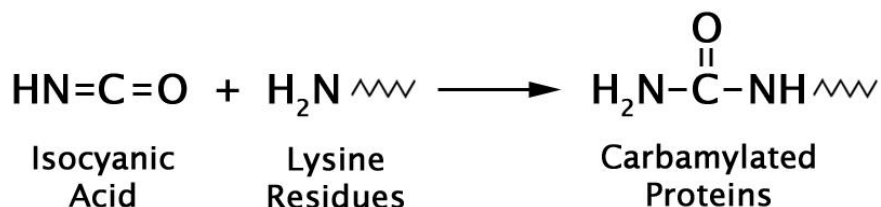
Figure 1: Formation of Carbamyl-Lysine (CBL) During Carbamylation of Proteins.

Carbamylation is a post-translational modification which occurs throughout the lifespan of proteins in vivo. Carbamylation results from the binding of isocyanic acid, spontaneously derived from high concentrations of urea and leading to the formation of carbamyl-lysine (CBL) (Figure 1). The carbamylation of proteins is usually associated with a partial or complete loss of protein function. It is known that elevated urea directly induces the formation of potentially atherogenic carbamylated LDL (cLDL). High blood concentrations of urea leading to the carbamylation process were detected in uremic patients and patients with end-stage renal disease.