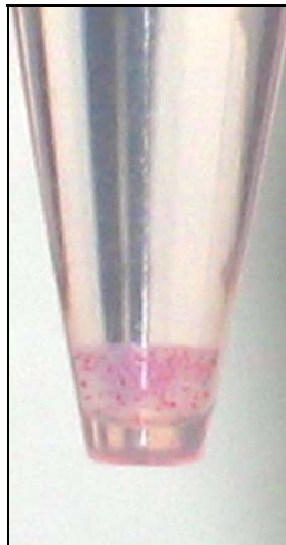
Figure 1: Rhotekin-RBD Beads in Color

Rhotekin RBD Agarose beads, in color, are easy to visualize, minimizing potential loss during washes and aspirations of Rho-GTP pulldown (Figure 1).