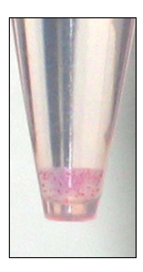
Figure 1: Rhotekin-RBD Beads in Color

Rhotekin RBD Agarose beads, in color, are easy to visualize, minimizing potential loss during washes and aspirations of Rho-GTP pulldown (Figure 1).