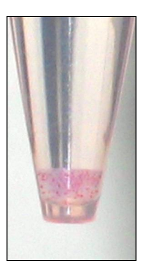
Figure 1: Rhotekin-RBD Beads in Color

Rhotekin RBD Agarose beads, in color, are easy to visualize, minimizing potential loss during washes and aspirations of Rho-GTP pulldown (Figure 1).