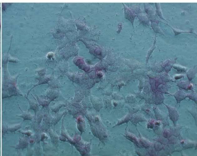
Figure 1: AP staining of ES Cells. Murine embryonic stem cells (ES-D3) are maintained in an undifferentiated stage on gelatin-coated dishes in the presence of LIF, as indicated by the high AP activity. To induce differentiation, LIF was withdrawn over a period of several days; various differentiation events were observed (cells became flattened and enlarged with reduced proliferation). At the end of day 5, AP staining of undifferentiated cells was performed as described in the Assay Protocol.