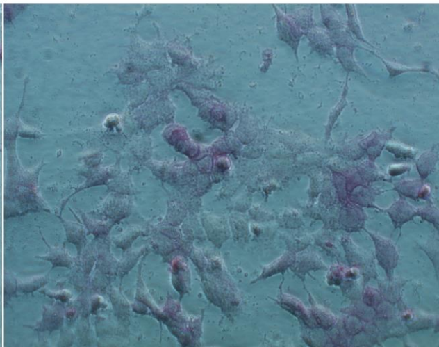
Figure 1: AP staining of ES Cells. Murine embryonic stem cells (ES-D3) are maintained in an undifferentiated stage on gelatin-coated dishes in the presence of LIF, as indicated by the high AP activity. To induce differentiation, LIF was withdrawn over a period of several days; various differentiation events were observed (cells became flattened and enlarged with reduced proliferation). At the end of day 5, AP staining of undifferentiated cells was performed as described in the Assay Protocol.