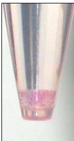
Figure 1: Raf1 RBD Agarose beads, in color, are easy to visualize, minimizing potential loss during washes and aspirations.

Cell Biolabs' N-Ras Activation Assay Kit provides a simple and fast tool to monitor the activation of N-Ras. The kit includes easily identifiable Raf1 RBD Agarose beads (Figure 1), pink in color, and a N-Ras Immunoblot Positive Control for quick N-Ras identification. This Trial Size kit provides sufficient quantities to perform 5 assays.