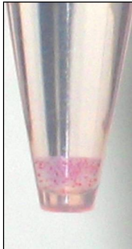
Figure 1: Rhotekin-RBD Beads in Color

Rhotekin RBD Agarose beads, in color, are easy to visualize, minimizing potential loss during washes and aspirations of Rho-GTP pulldown (Figure 1).