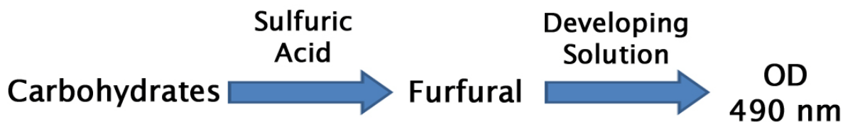
Figure 1. Total Carbohydrate Assay principle.

Cell Biolabs' Total Carbohydrate Assay Kit measures total carbohydrate within food samples, urine, serum, plasma, lysate, or tissue samples based on the phenol-sulfuric acid method. Carbohydrates are hydrolyzed to furfural and other derivative forms in the presence of sulfuric acid. Upon addition of Developing Solution, a chromagen is formed that can be detected at 490 nm (Figure 1).